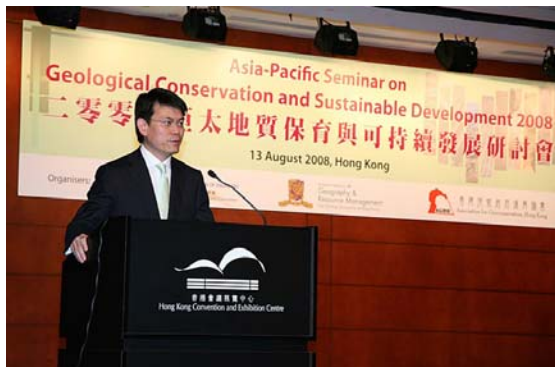
邱騰華局長 Mr. Edward Yau JP