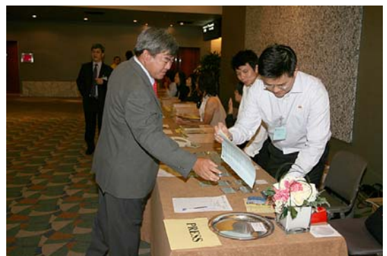
~ We are ready ~