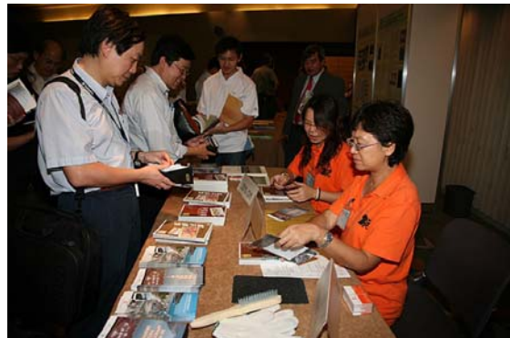
~ AGHK booth ~