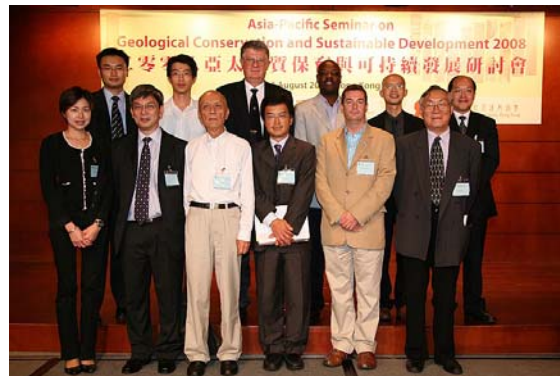
Speakers and all Committee members